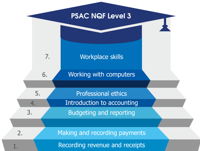
Public Sector Accounting Certificate